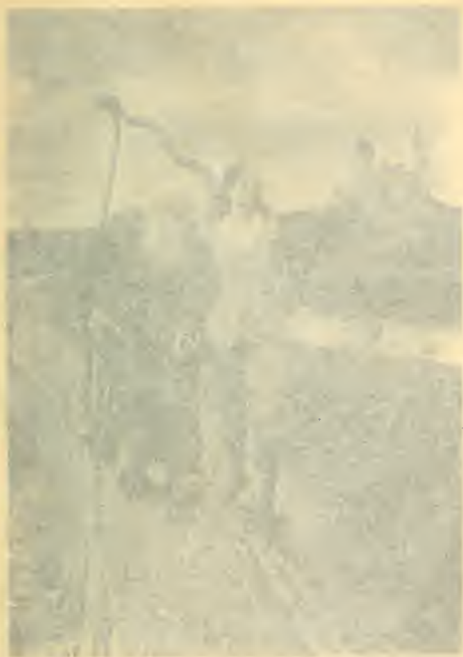
View from the road to the east of the Cape of Good Hope, showing the Cape of Good Hope and the Cape of Storms.